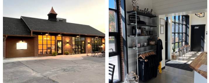
Downtown West Branch, Iowa