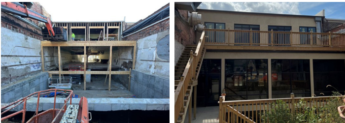
Downtown Ottumwa, Iowa