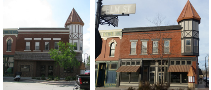
Bank Building, Avoca