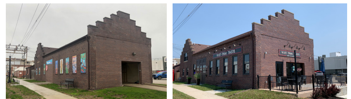
Viet-Thai Taste, Newton